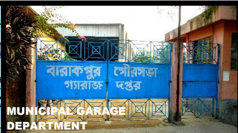
MUNICIPAL GARAGE DEPARTMENT