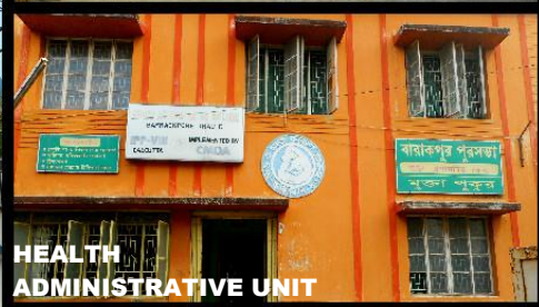
HEALTH ADMINISTRATIVE UNIT