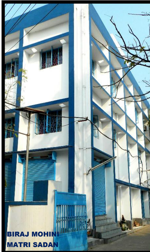
BIRAJ MOHINI MATRI SADAN